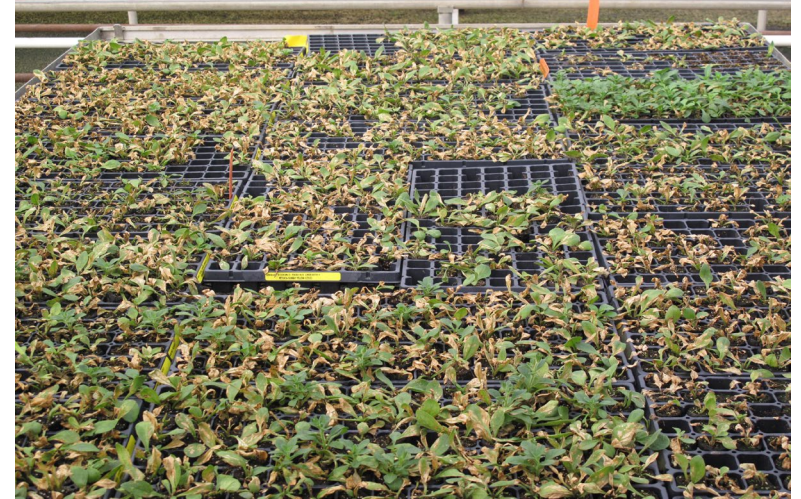
Photo 2. Trays of yellow petunia cultivars exhibiting extreme symptoms.

Where trade names, proprietary products, or specific equipment are listed, no discrimination is intended and no endorsement, guarantee or warranty is implied by the authors, universities or associations.