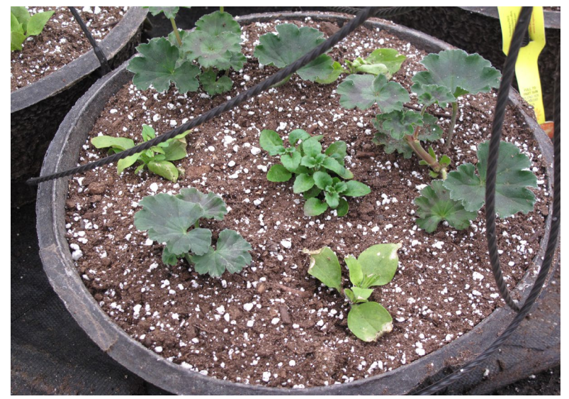
Photo 3. Growers have also found that after transplant some rooted yellow petunia cultivars can appear stunted, have low vigor, and most often have to be removed from the combination planters or cell packs.