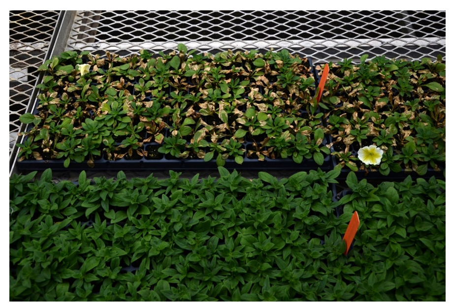
Photo 1. Growers have found that cuttings of some yellow petunia cultivars often root well, but toward the end of liner rooting stage 3, they can lose vigor, turn yellow, develop necrotic (brown) shoot tips, and/or die (top) compared to other cultivars (bottom).

a significant role in reducing the yellowing, necrosis and loss of vigor of these cultivars during propagation. In order to investigate if this was indeed the case, research was conducted at Ball Horticulture Company in West Chicago, Illinois and